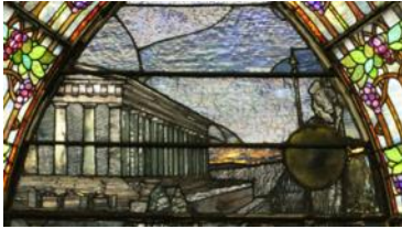
Acropolis and Athena Statue