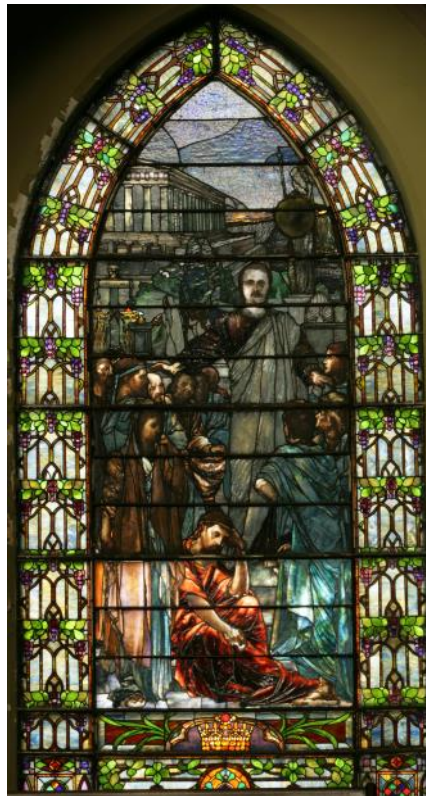
St. Paul Preaching at Athens

When asked about first impressions of the St. Paul window, Tom immediately points out that the window is “out of tune.” The composition of the St Paul window