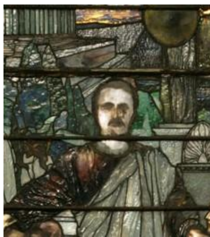
Face of St. Paul in stained glass window

of over 12,000 pieces of glass and each separate piece is artistic in itself, many of them having the value of precious and semi-precious stones. The general design is built upon a floral curve rising up and surrounding a jeweled cross. The cross and its surrounding ornaments springing bulb-like from the frame which contains the holy name of the divine Redeemer. This window is surrounded by a border having all the richness of a silk Persian rug.”