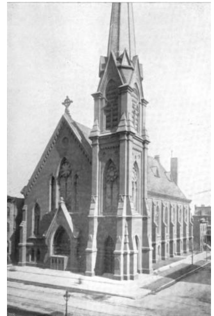
First Presbyterian Church at 21st and Indiana Avenue

First Presbyterian was a well-to-do congregation, and they showed their devotion by lavishing the church with costly memorial windows and an expensive organ by Hooks and Hastings. There are three significant stained glass windows mentioned in