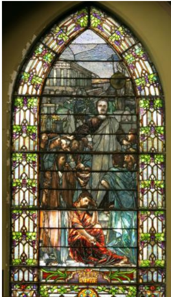
“St. Paul Preaching at Athens”

The magnificent memorial window “St. Paul Preaching at Athens” - on track to be removed for restoration in the Spring – is one of three windows that were acquired from First Presbyterian Church then located at Indiana and 21 st streets, and installed at Second Presbyterian in 1927.