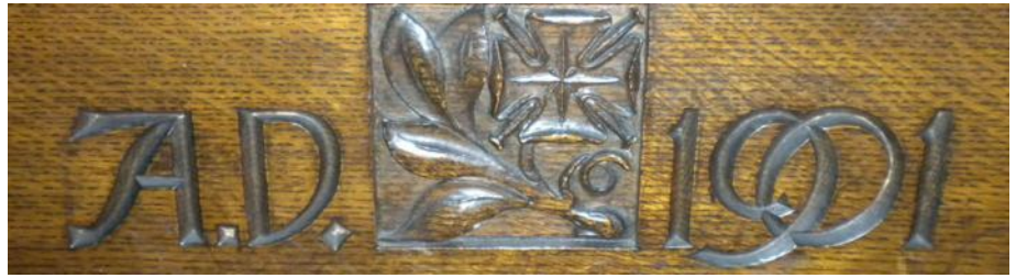
Above: Pastor's chair date detail.

It is quite possible that the two side chairs on the pulpit were stock pieces as well, as the Colby company produced many examples of historic-based furniture. The chairs, with their wavy X silhouette, are based on an early form of a chair known variously as an X-frame, Dante, scissors, or Savonarola chair. The form upon which they are based became popular in Medieval and Renaissance Italy