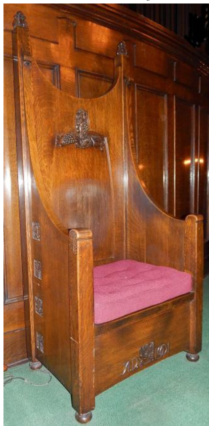
Pastor's chair.