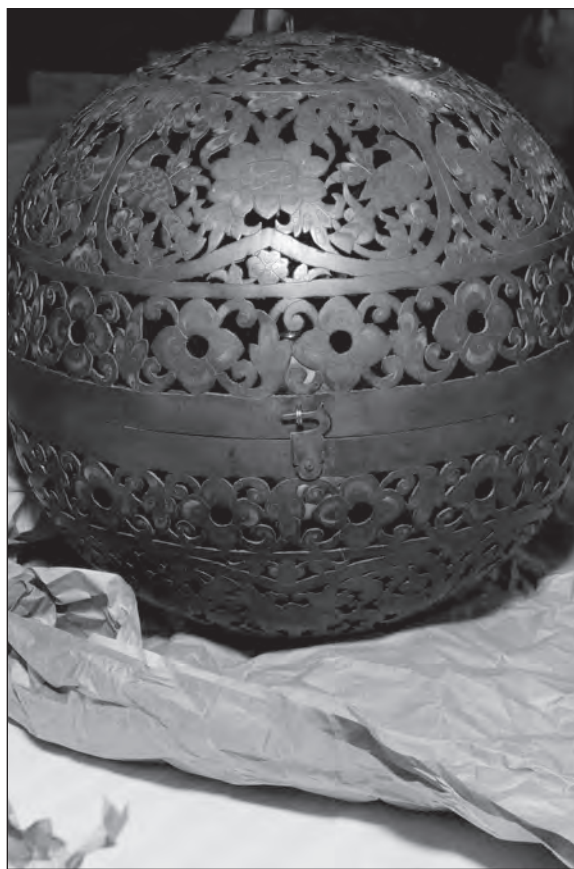
The newly restored 'moon' globe.

The moon fixture was in good condition, although extremely dirty. There was no noticeable damage to the fixture, and the cloth lining though stained, was relatively intact. The sun fixture had not been illuminated for months and was in much poorer condition. The structure connecting the globe to the chain above had long ago broken, and the globe was being held in place only by a tiny piece of wire and the electrical wire. The three hinges connecting the top and bottom halves were all broken and in their place, wire was fed and twisted. A couple of the sections of metalwork had come apart, and there were some dents, apparently from an earlier fall. Janko made the necessary repairs and replaced the cloth lining. They were reinstalled by an electrician in early October.