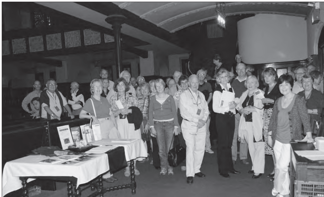
The Worshipful Company of Glaziers and Painters of Glass.