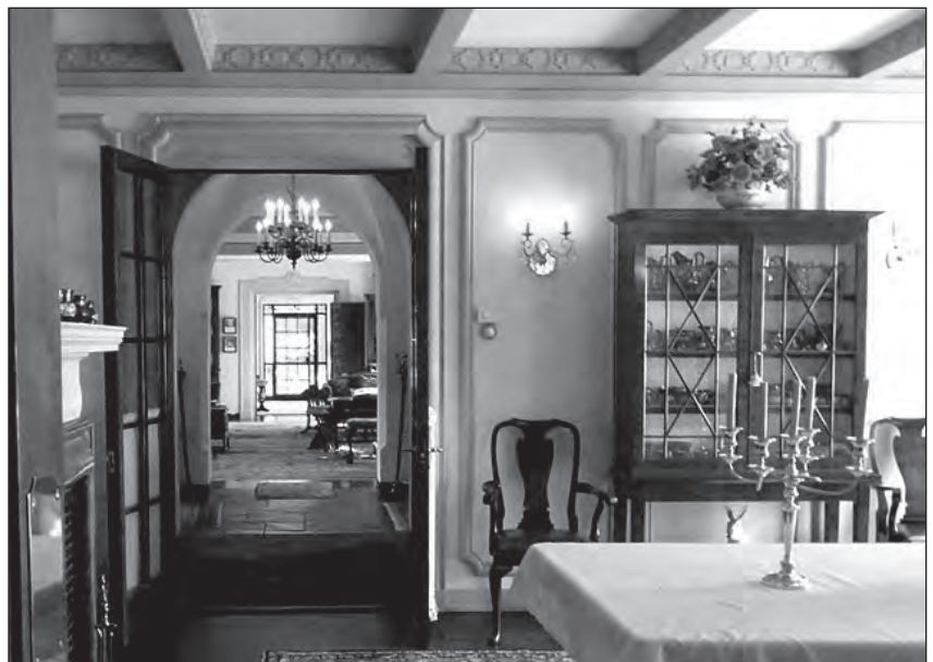
Top: Garden designed by Rose Standish Nichols. Bottom: Interior view of house.