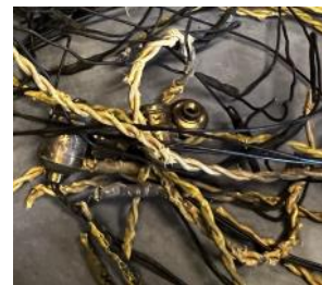
1901 Cloth Wiring

thermoplastic coating for wiring replaced the cloth. It is well known that the cloth covering can deteriorate over time and become brittle. Can you describe the condition of the wiring in the sanctuary. Was the wiring and its condition what you expected?