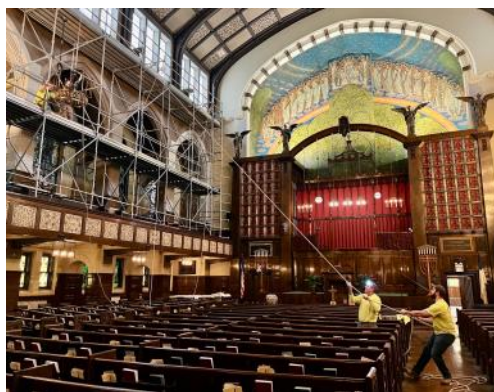
Be&Z Electric works on a crown chandelier.