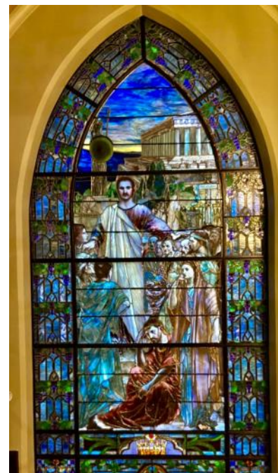
Restored St. Paul Preaching at Athens Window