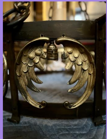
Angel wings on the chandeliers

Among the many unique features of Second Presbyterian Church are its 10 highly distinctive "crown chandeliers,"