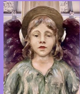
Angel bracket face