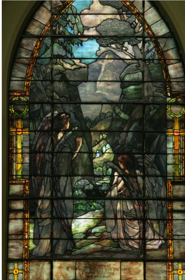
Mount of the Holy Cross Window