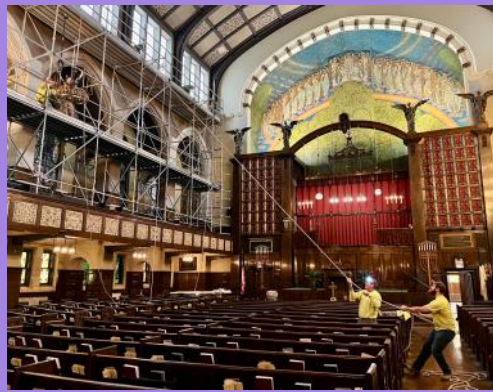
B&Z Electric lowering one of the chandeliers.

In January, Gilco Scaffolding Co. erected a 35-foot-tall scaffold atop the steel-framed south balcony. The multi-tiered scaffold enabled the electrical contractor, B&Z Electric, to carefully